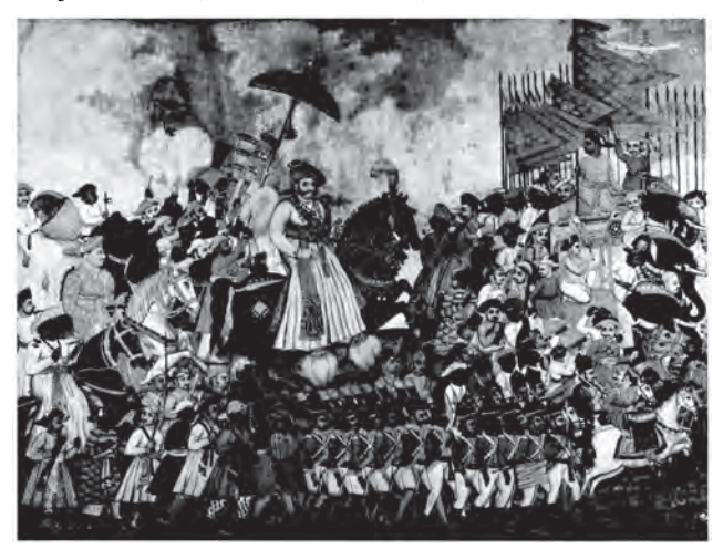
Figure 1 Serfoji in procession along with the Tanjore Band, Tanjore, c.1820 (Archer 1970: Plate 5)

will particularly focus on the contribution of Serfoii (reign: 1798-1832), Maratha King of Thanjavur, who is said to have been the first Indian composer appropriating Western styles. He established the Tanjore (Thanjavur) Band, a military band attached to his palace and composed music for the band (Figure 1). I will also refer other examples of the Western impact on Indian music of the same period such as