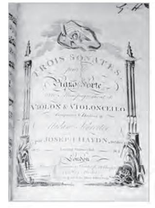
Figure 9 Trois Sonates by Joseph Haydn Preserved in the Sarasvati Mahal Library

The Serfoji II's collection shows us that the music popular among