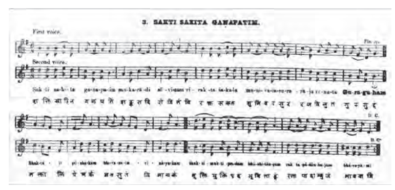
Figure 13 "Śakti sahita ganapatim" in Oriental Music in European Notation (Staff notation by A. M. Chinnaswami Mudaliyar 1892)

ganapatim' (Figure 13), 'Śyāmale mīnāksī', and 'Vande mīnāksī' often sung by children or beginners even today. All the melodies of Nottusvara Sahitya are set to the raga