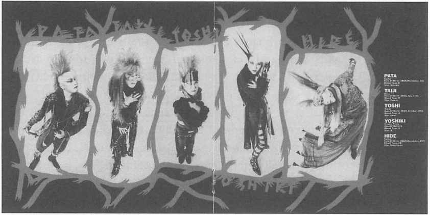
Photo 8-1: From left; Pata, Taiji Toshi, Yoshiki and Hide ( Blue Blood , 1989).

broadcasting station NHK between two groups, the red team for female singers and the white team for male singers) broadcast live on the last day of the year, and considered to be a national event. Ever since X successfully held a three-day live concert in the Tokyo Dome, as the first among Japanese rock bands, large-scale rock concerts have become very common. 22 Thus no-one can deny X is an important figure in the Japanese popular music scene.